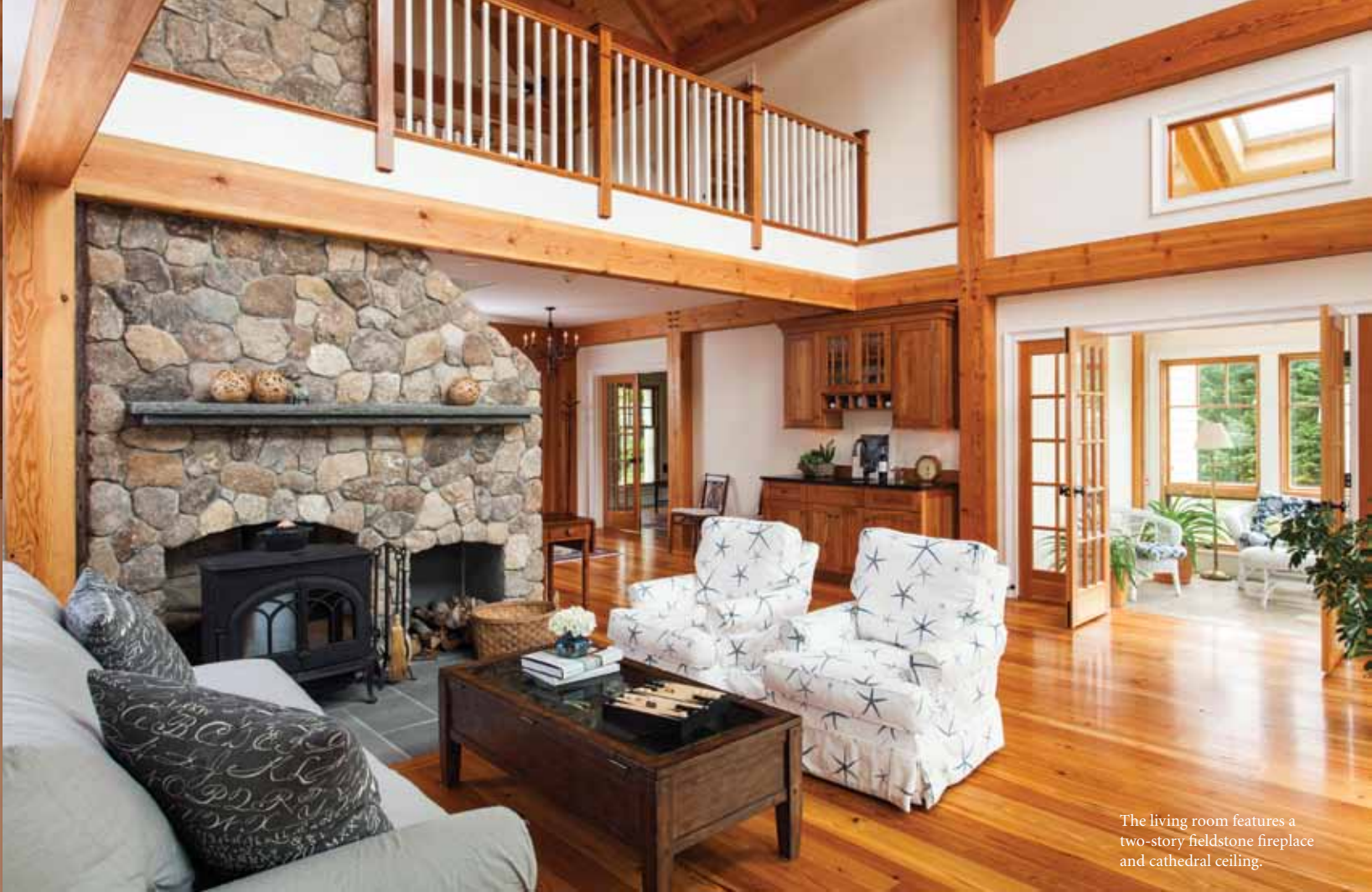
The living room features a two-story fieldstone fireplace and cathedral ceiling.