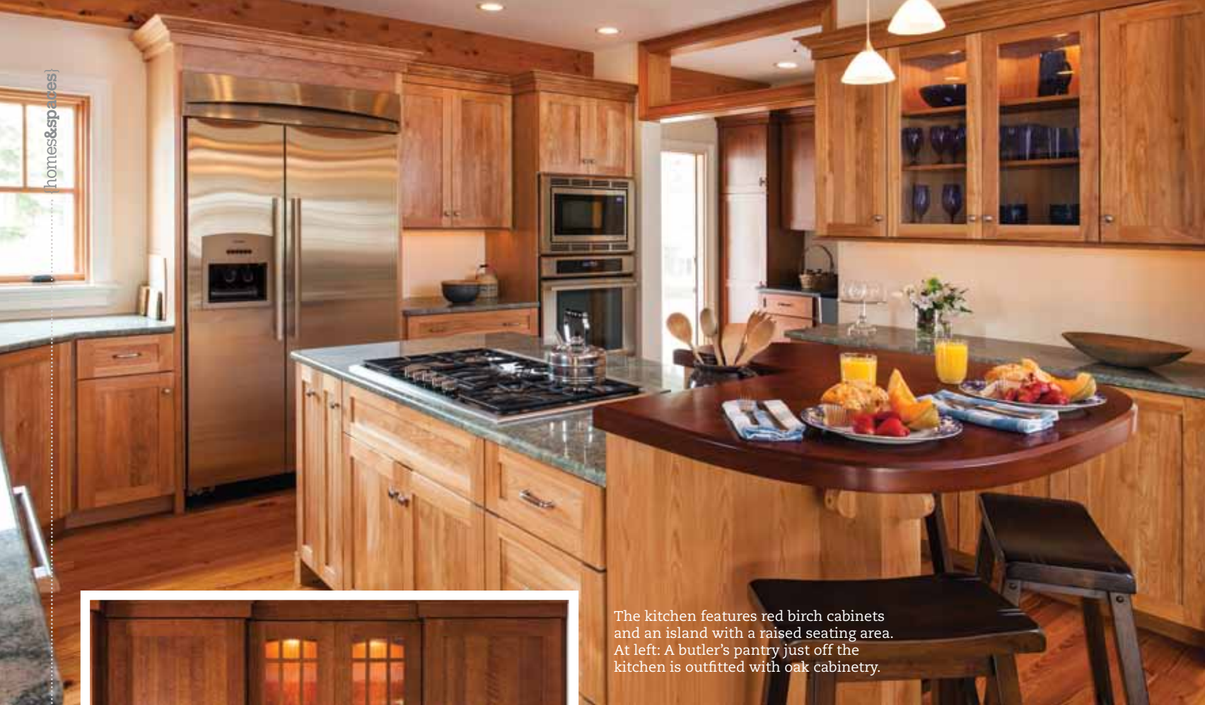
The kitchen features red birch cabinets and an island with a raised seating area. At left: A butler's pantry just off the kitchen is outfitted with oak cabinetry.