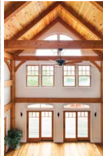
From top: The dramatic cathedraled ceiling in the main living area. The exterior of the home has a classic seaside feel. A baby grand piano is tucked into a nook in the den.