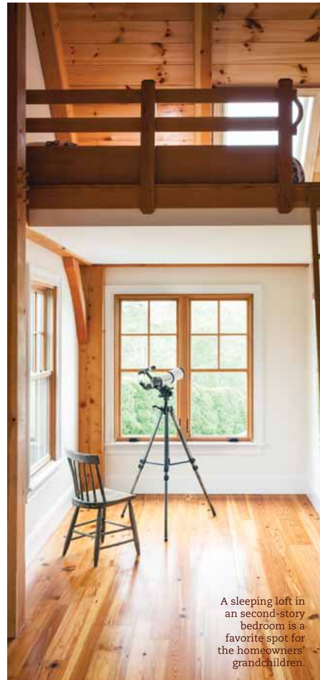
A sleeping loft in an second-story bedroom is a favorite spot for the homeowners' grandchildren.