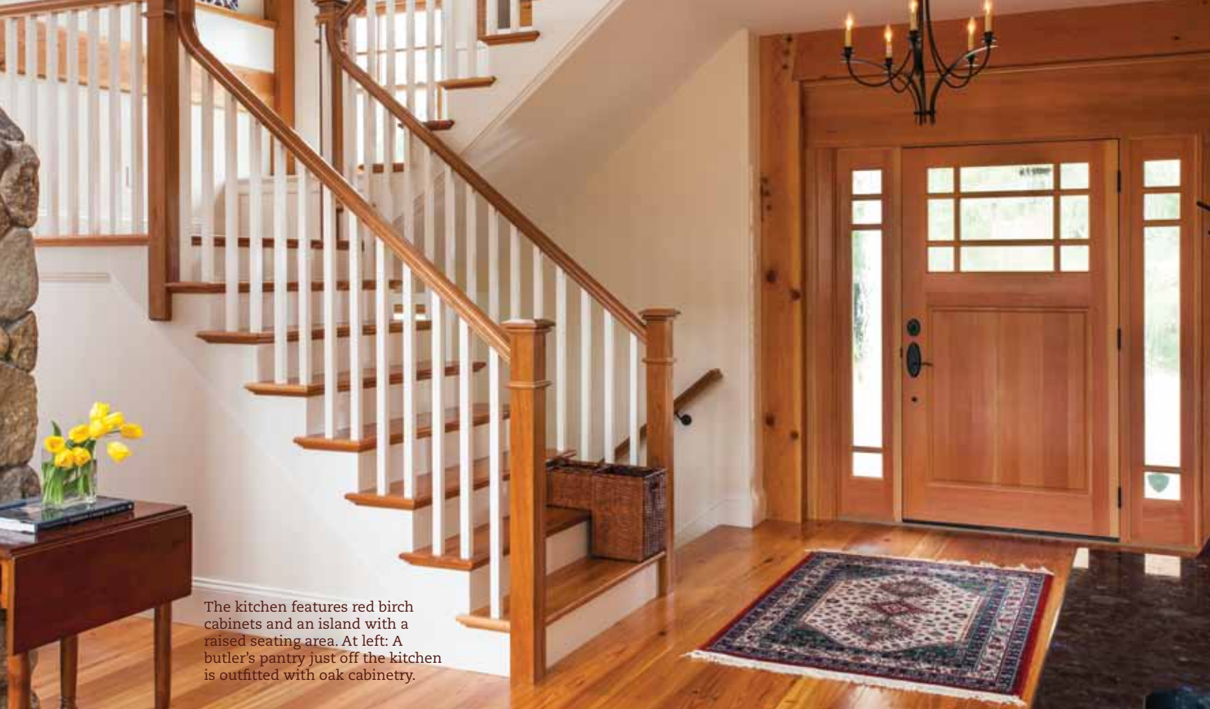
The kitchen features red birch cabinets and an island with a raised seating area. At left: A butler's pantry just off the kitchen is outfitted with oak cabinetry.